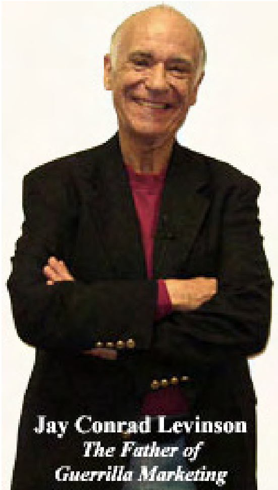
Jay Conrad Levinson The Father of Guerrilla Marketing

Jay Conrad Levinson is the author of the best-selling marketing series in history, "Guerrilla Marketing," plus 30 other books. His books have sold 14 million copies worldwide. His guerrilla concepts have influenced marketing so much that today his books appear in 41 languages and are required reading in many MBA programs worldwide.