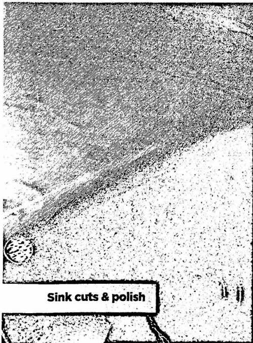
Sink cuts & polish

https://usenaturalstone.org/properties-of-quartzite/