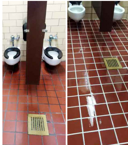
Quarry Tile & Grout Coated With X-PROTECT PERFORMANCE TOPCOAT - High Gloss (John Deere Facility/ Before & After Comparison)