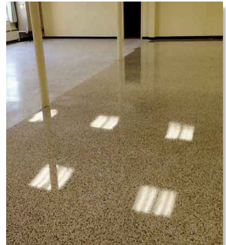
Terazzo Flooring Coated With X-PROTECT PERFORMANCE TOPCOAT - High Gloss (Before & After Comparison)